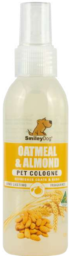
Oatmeal & Almond

The natural and sweet smelling Smiley Dog Pet Cologne range includes 8 x different scents, each available in 30ml and 125ml sizing. Formulated to neutralise 'wet coat' and other unpleasant odour, the subtle colognes are noticeable to humans without being overpowering for our pets. Each cologne has been carefully developed and is biodegradable with no propellant. Best used in-between washes with an aroma that lasts for up to 4 days.