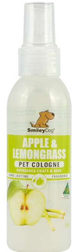
Apple & Lemongrass