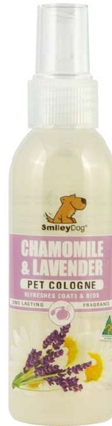
Chamomile & Lavender