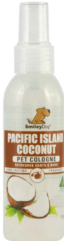
Pacific Island Coconut