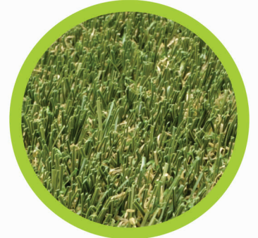
Pet 30 COOLplus™