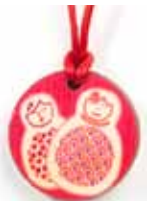
Babushka warms SP-PEWOBU-75 20x20mm