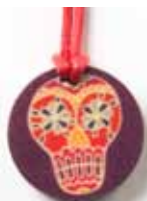
Skull rainbow SP-PEWOFD-100 20x20mm