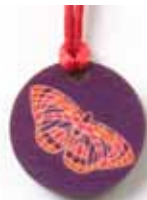
Butterflies pink multi SP-PEWOBF-82 20x20mm