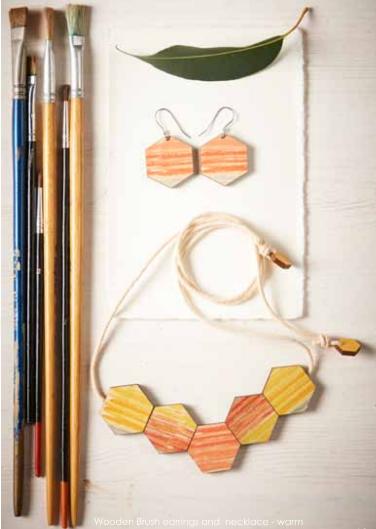
Wooden Brush earrings and necklace - warm