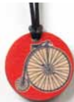
Penny red & blue SP-PEWOPE-110 20x20mm