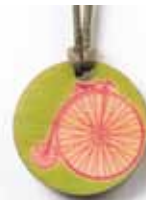
Penny watermelon SP-PEWOPE-79 20x20mm