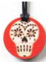
Skull red SP-PEWOFD-01 20x20mm