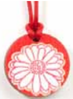
Daisy white SP-PEWODI-62 20x20mm