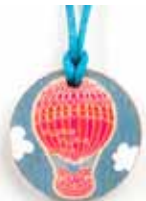
Balloon warms SP-PEWOHAB-75 20x20mm