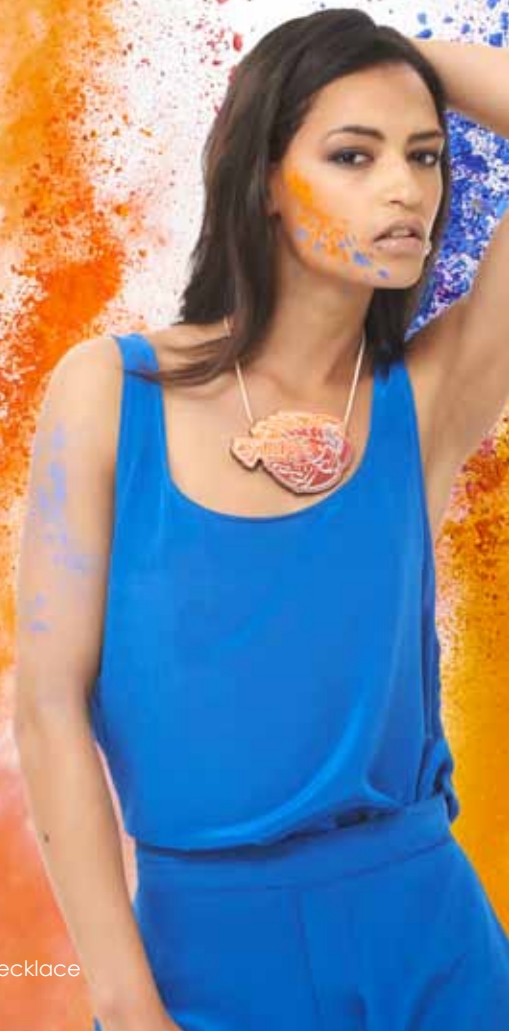
Wooden Lobster necklace