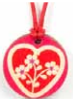
Heart warms SP-PEWOHE-75 20x20mm