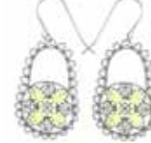
Doily-Med EASWLA-M-53 32x22mm