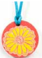
Daisy sunshine SP-PEWODI-07 20x20mm