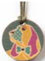
Bernard aqua & ochre SP-PEWOBN-115 20x20mm