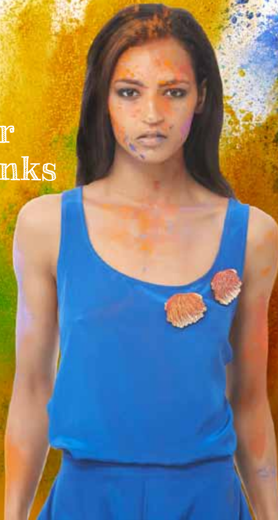
Wooden Gum Blossom Brooch red and warm

The bold hexagonal brooches are made from 3 individual painted beads bringing new colour combinations. Each wooden piece is kept safe in a special reusable organic cotton pouch.