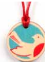
Robin red & blue SP-PEWORN-110 20x20mm