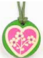
Heart watermelon SP-PEWOHE-79 20x20mm