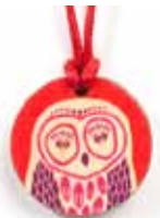
Hoot warms SP-PEWOHO-75 20x20mm