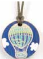
Balloon blues SP-PEWOHAB-78 20x20mm