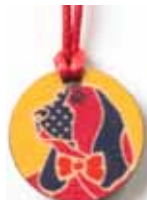
Bernard pink & blue SP-PEWOBN-111 20x20mm