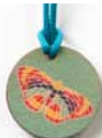
Butterflies rainbow SP-PEWOBF-100 20x20mm