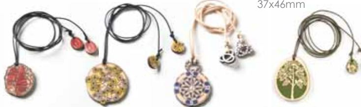
Fig Tree olive PEWOFB-38 37x46mm