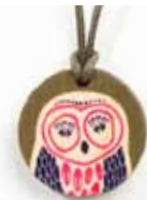
Hoot olive SP-PEWOHO-38 20x20mm