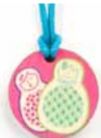
Babushka watermelon SP-PEWOBU-79 20x20mm