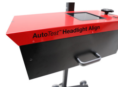
AutoTest® Headlight Align Headlight Aimer