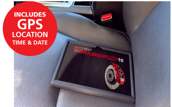
The Workshop Pro® 10 is compact and complete with a range of unique features. This versatile tablet integrates with many AutoTest diagnostic tools.