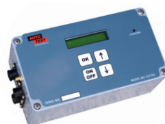
AutoBlast® Ground Vibration Logger