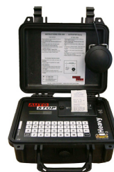
AutoStop® Heavy Brake Meter