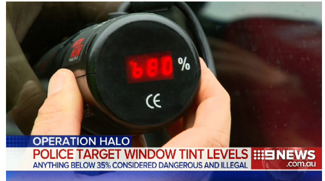
AutoTest's AutoLight appeared on Channel 9 News in April 2016, and featured police officers using AutoLight as part of a Victorian safety initiative.

Compact, lightweight, accurate and easy to operate were the founding principles underpinning AutoLight's development, and remain at the heart of its success.