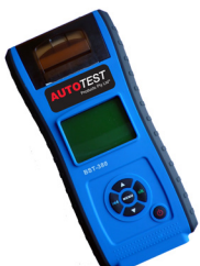
AutoTest® BST-380 Battery System Tester & printer