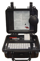
AutoStop® Maxi Brake Meter