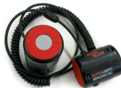
AutoLight® MAGNETIC Hands-free Window Tint Meter & Bluetooth opt.