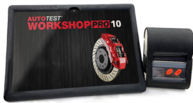
AutoTest® Workshop Pro 10 10" Tablet Based Brake Meter & Workshop Tool