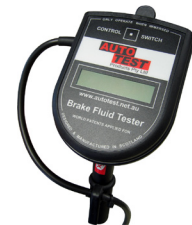
AutoTest® Brake Fluid Tester Brake Fluid Tester