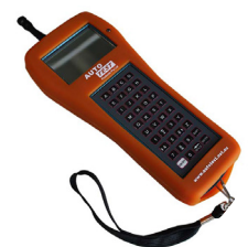
AutoTest® BAMBINO Bear Acoustic Monitor