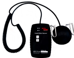
AutoStop® Pedal Effort Sensor Brake Tester