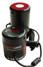
AutoLight® & AutoLight® PLUS Window Tint Meter & Bluetooth opt.