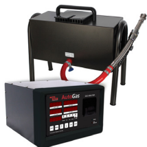
AutoGas & AutoSmoke Gas Analyser & Opacity Meter