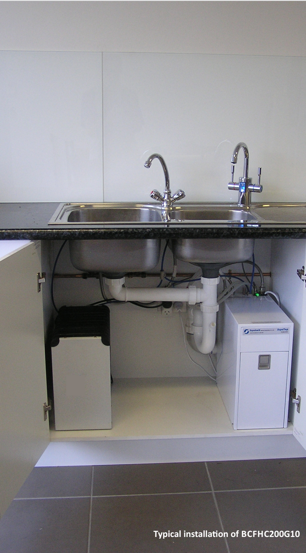
Typical installation of BCFHC200G10