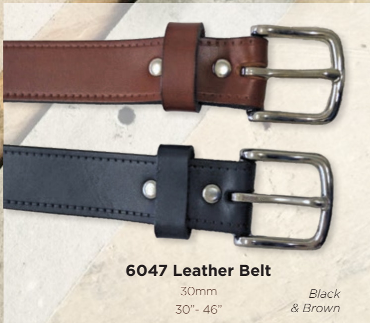
6047 Leather Belt 30mm 30"- 46" Black & Brown