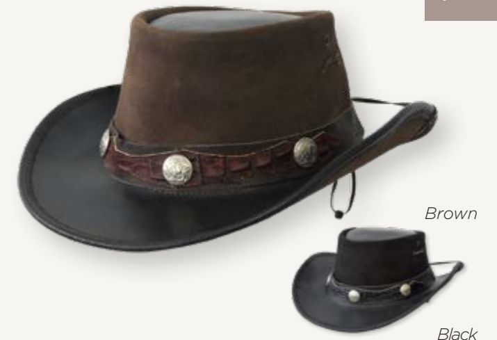
1078 Texas Suede Full Grain Cowhide, Shapeable Brim, & Chinstrap, Water Resistant S • M • M/L • L • XL • 2XL