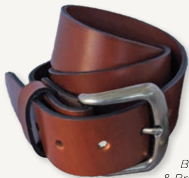
Black & Brown