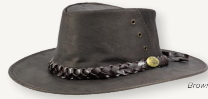
1015 Capricorn Buffalo Leather, Unique Hatband Water Resistant S • M • M/L • L • XL • 2XL