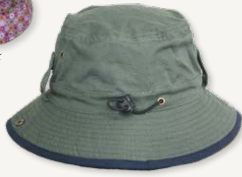
1823 Cotton Bucket Hat