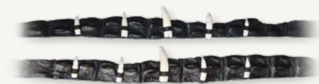
6567 Croc Leather, 5 Croc Teeth Black 6567 Croc Leather, 5 Croc Teeth Brown