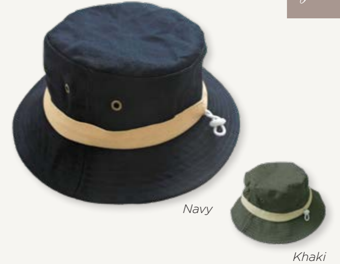
1810 Elastic Cord Bucket Hat