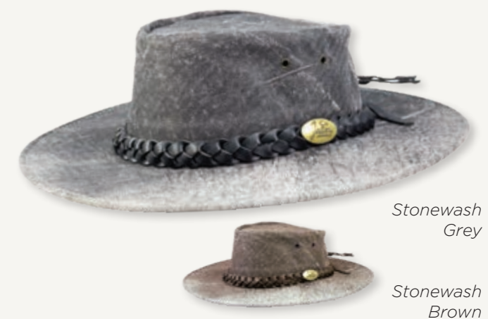
1172 Kangaroo Stonewash Kangaroo Leather, Water Resistant S • M • M/L • L • XL • 2XL