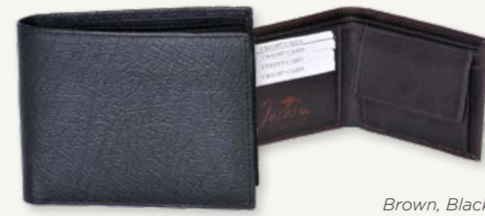
Brown, Black & Stonewash

5786 Flap Wallet - Mens Genuine Kangaroo Leather Individually Boxed - 12 x 10cms