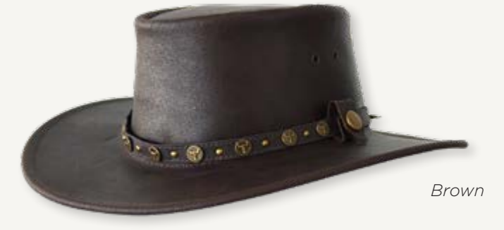
1071 Waxed Leather Waxed Leather, Unique Hatband Water Resistant S • M • M/L • L • XL • 2XL