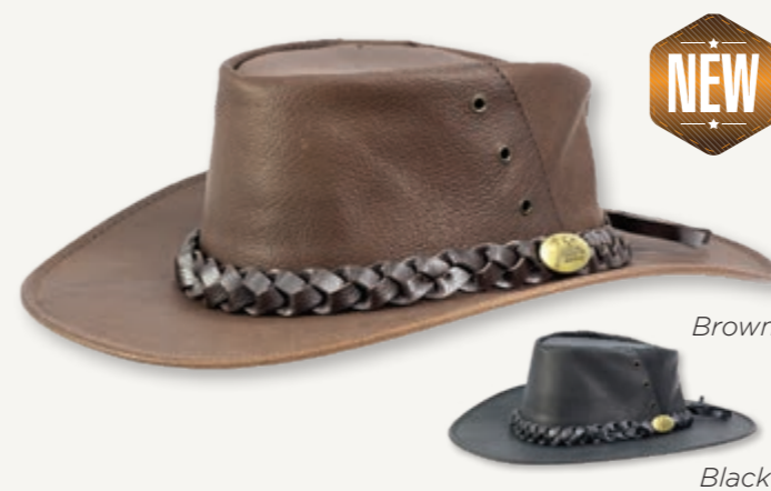
1001P Kangaroo Premium A premium version of the popular Kangaroo. Superior Quality Kangaroo Leather, Water Resistant S • M • M/L • L • XL • 2XL