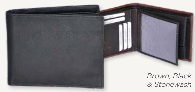
Brown, Black & Stonewash

5790 Slim Purse Genuine Kangaroo Leather Individually Boxed 17 x 10cms