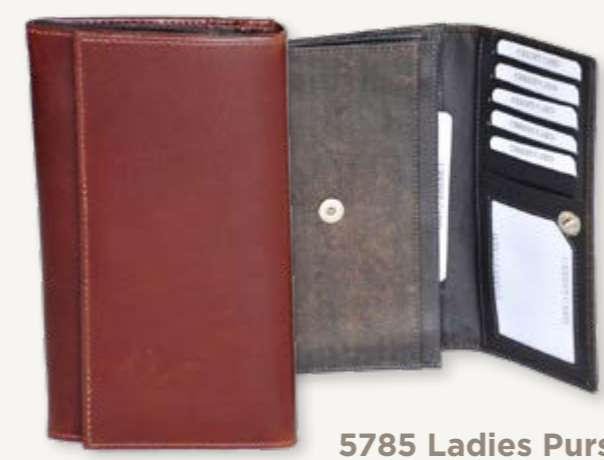
Brown, Black & Stonewash

5788 Card Holder Genuine Kangaroo Leather Individually Boxed - 9.7 x 8cms