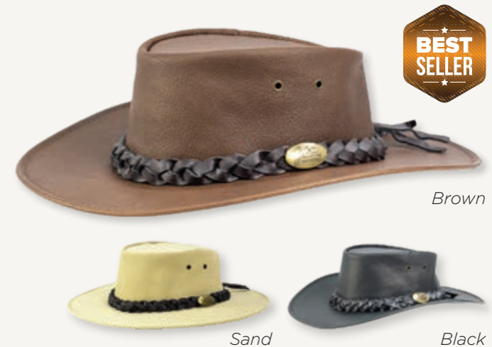
1001 Kangaroo Kangaroo Leather, Water Resistant S • M • M/L • L • XL • 2XL