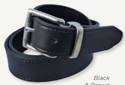
Black & Brown