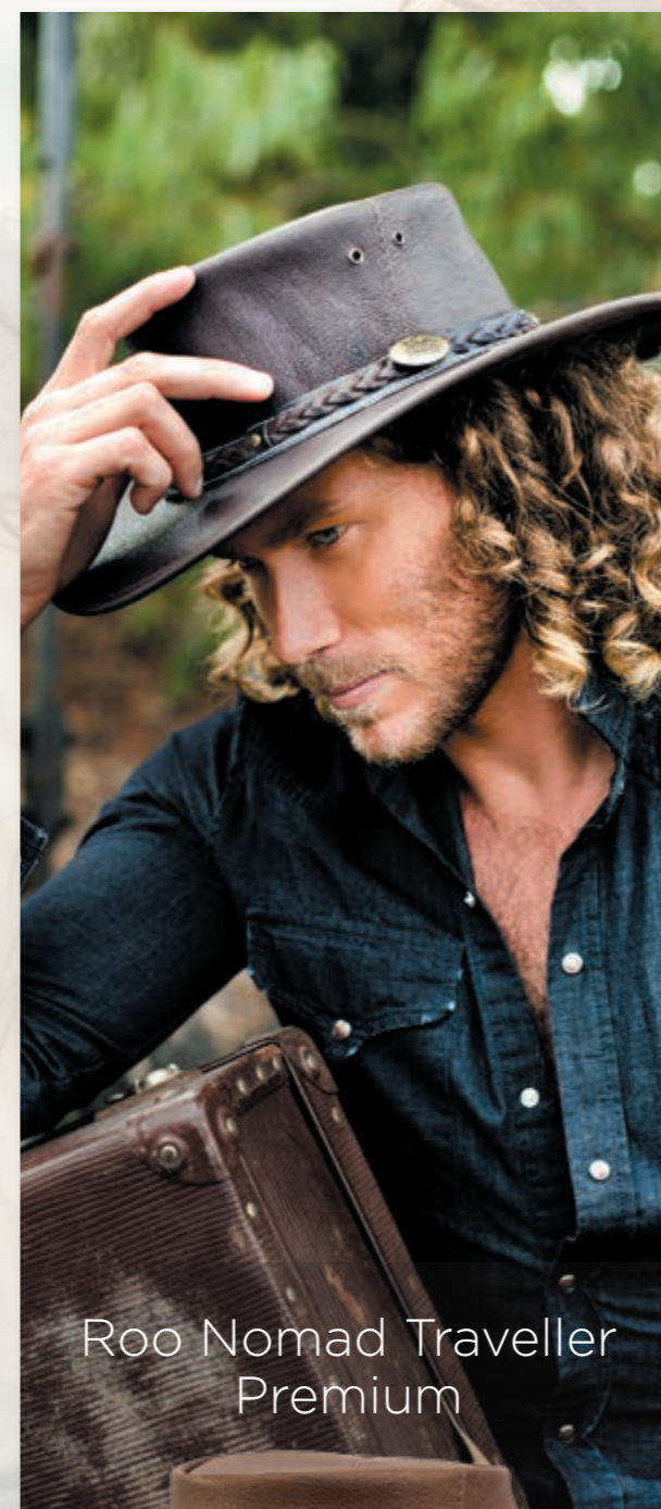
Roo Nomad Traveller Premium

Our two most iconic hats are now also available in a new premium version in addition to our standard models. Available in brown and black.