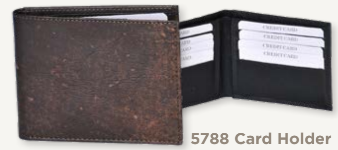
Brown, Black & Stonewash

5787 Coin Wallet Genuine Kangaroo Leather Individually Boxed - 11.5 x 9cms