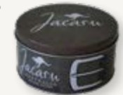
6012 Leather Belt 30mm 30"- 46"