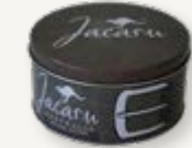
6013 Leather Belt 40mm 30"- 46"