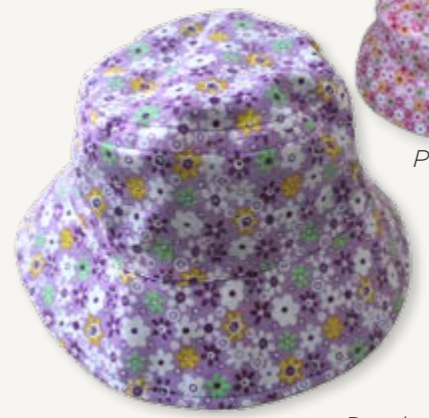
1807 Small Flower Bucket Hat