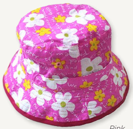
1808 Large Flower Bucket Hat