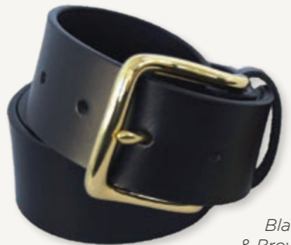
Black & Brown