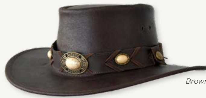
1074 Waxed Leather Waxed Leather, Unique Hatband, Water Resistant S • M • M/L • L • XL • 2XL