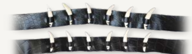
6502 Printed Croc, 6 Teeth Black 6502 Printed Croc, 6 Teeth Brown