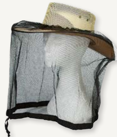
6508 Fly Net Black