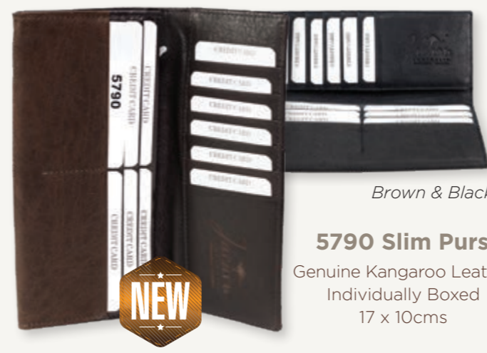
Brown & Black

5790 Slim Purse Genuine Kangaroo Leather Individually Boxed 17 x 10cms