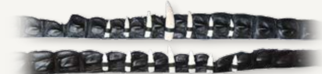
6531 Croc Leather, 7 Teeth Black 6531 Croc Leather, 7 Teeth Brown