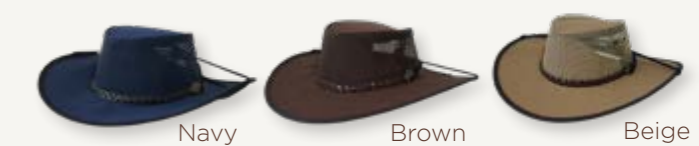
Navy Brown Beige