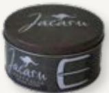
6037 Leather Belt 38mm 30"- 46"