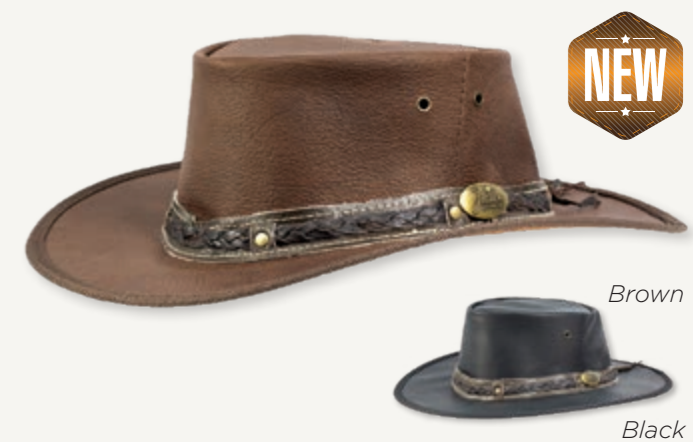
1111P Roo Nomad Traveller Premium A premium version of the popular Roo Nomad Traveller. Superior Quality Kangaroo Leather, Water Resistant S • M • M/L • L • XL • 2XL