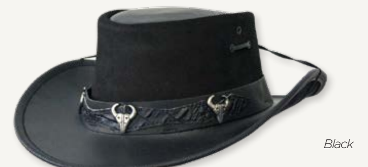
1079 Rodeo Suede Full Grain Cowhide, Shapeable Brim, & Chinstrap, Water Resistant S • M • M/L • L • XL • 2XL