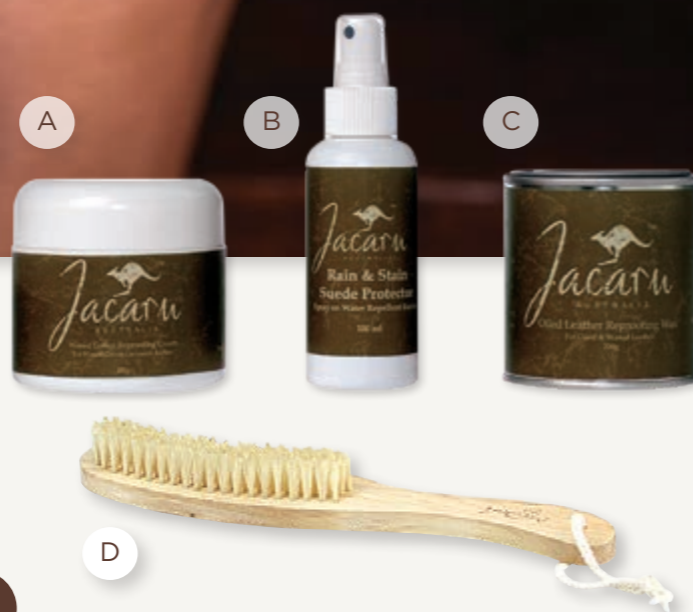
A. 6705 Waxed Cotton Reproofing Wax

Visit our website for more information on product care.