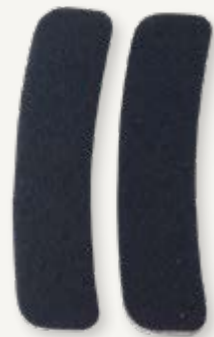
6515 Hat Reducer Pack of 2 Black