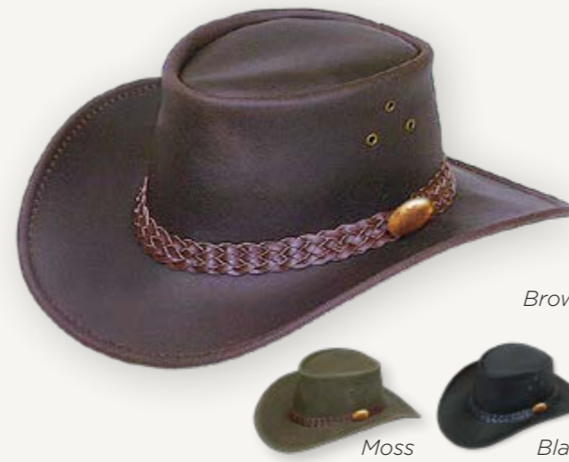
1006 Wallaroo Oil Oiled Waxed Leather Water Resistant S • M • M/L • L • XL • 2XL