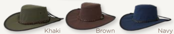
Khaki Brown Navy