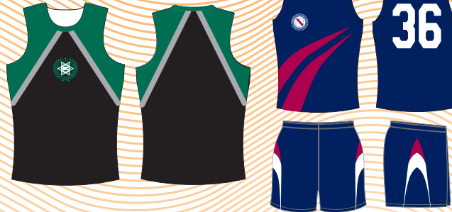
ATHLETIC SINGLETS, SPORTS TOPS & SHORTS