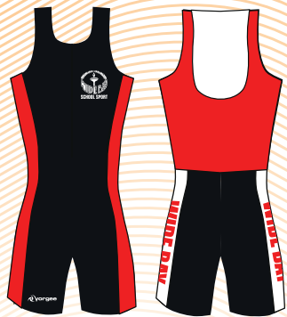
TRIATHLON SINGLETS & SUITS

Glyder's alignment with respected aquatic brand, Vorgee, means we have a great understanding of aquatics and the needs of those who enjoy and engage in aquatic sports and activities. These include schools, swimming clubs, aquatic centres and surf clubs.