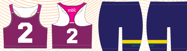
CROP TOPS & BIKE PANTS

From the basketball court, and gymnastics, to the running track, Glyder produces garments to suit a wide range of sports. These products are made with comfort, function, fit and durability in mind. Like all of Glyder's products, our sportswear is Australian made and uses only fabrics of a high quality.