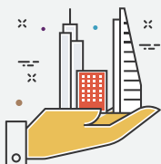
Off grid heating systems