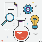
Industrial processes requiring heat