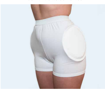
Sewn-In Shields - Unisex

We also offer a range of comfortable accessories, including polar fleece unisex trackpants with shield pockets, and non-slip socks made from soft New Zealand wool.