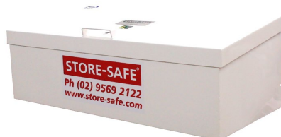
Ute Box – UB120