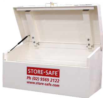
Vehicle Box – V120