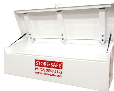
Ute Box – UB170

Trafalgar reserves the right to change specifications without notice. Please check with your supplier at the time of order. The information contained in this brochure was correct at the time of print. E&OE. Published 09.01.2019