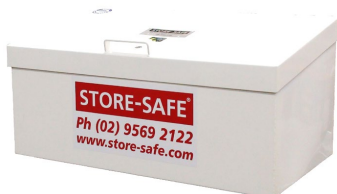
Ute Box – UB100