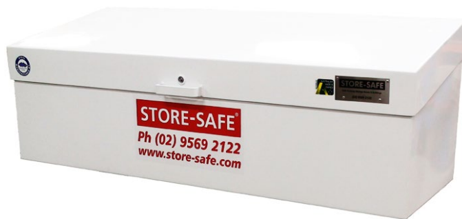
Vehicle Box – V170