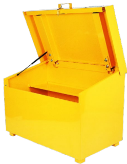
Site Box – S120