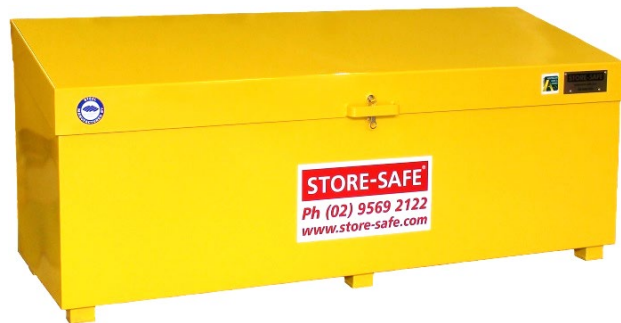
Site Box – S200