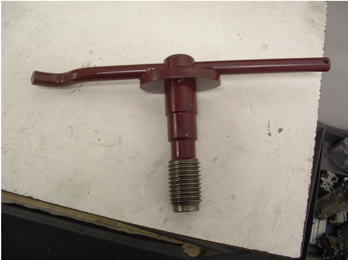
BOLT CLAMP 5" BALL COUPLING PART NUMBER - TC9515