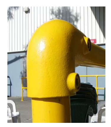
Built Up To A Standard Not Down To A Price!

Since establishment, the company has supplied professional engineering products and services to a wide variety of clients throughout Australia. Our products can be found in many diverse industry sectors such as Mining, Building & Construction, Transportation, Ship Building, Defence, Offshore Platforms, Power Generation and Water Utilities among others.