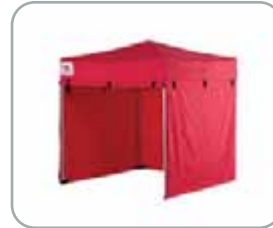
2.1m x 2.1m PRO "I.P." - Instant Privacy tent