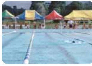
SCHOOL SPORTING ACTIVITIES