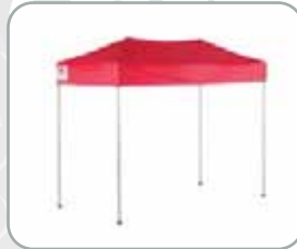
3.0m x 1.5m LWS (SINBIN)