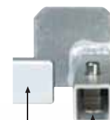
Larger strut Thicker inner leg