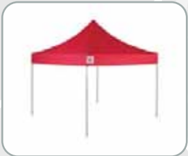
3.6m x 3.6m PRO