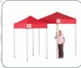
1.8m x 1.8m PRO