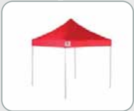
2.4m x 2.4m LWS/PRO/STUMPY