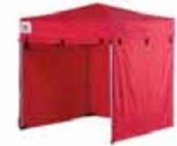
REAR AND SIDE WALLS