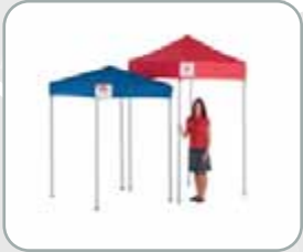
1.5m x 1.5m LWS