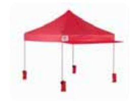
AWNING/S AND SAND BAGS