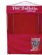
1/2 WALLS AND POCKETS FOR POSTERS

Awnings add extra shade, protecting your stock and customers alike. Extra legs are also available to reduce flapping of walls on those extra windy days, whilst sand bags add stability.