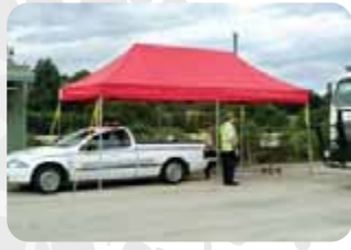
PROTECTION OF WORKERS