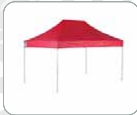
4.5m x 3.0m PRO