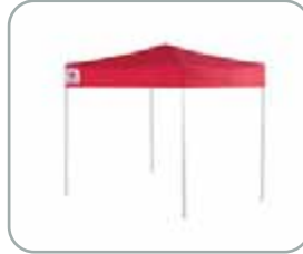
2.1m x 2.1m PRO