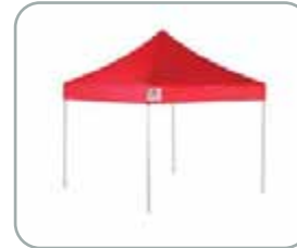
3.0m x 3.0m PRO