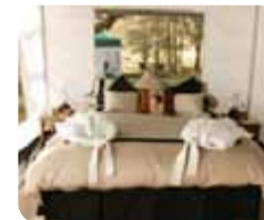
MESH WALLS - IDEAL FOR CAMPING