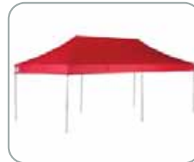
7.2m x 3.6m PRO