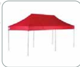
6.0m x 3.0m PRO